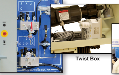
Cartridge Valve Manifolds

Amatrol's Turbine Nacelle Troubleshooting Learning System enables students to develop operation skills essential to wind turbine technicians. The system features turbine control software that enables a student to learn how to startup and shut-down wind turbine systems. The 950-TNC1 includes major components found in utility scale wind turbines such as a turbine control unit, hydraulic system with cartridge valves, brakes, yaw drive with dual motor drive,