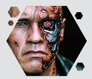
CGI & special effects