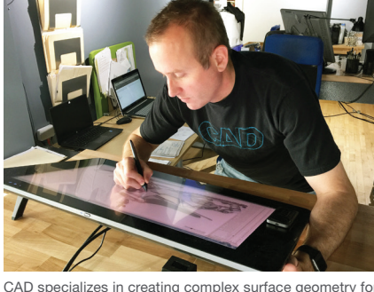
CAD specializes in creating complex surface geometry for the plastics industry.

Features of the Stratasys F370 like its minimal setup, fast-draft mode and autocalibration ensures less time troubleshooting and more time for the team to tackle the next complex design.