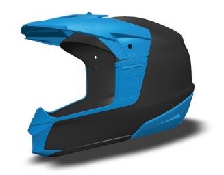
Render of CAD's helmet redesign highlighting a new camera mount, back piece and mouthpiece in blue.