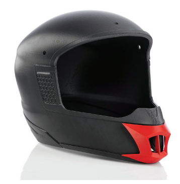
The helmet prototype was 3D printed in one build on the Stratasys F370.