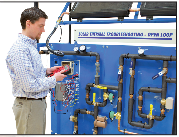
Student Reacting to Electrical Fault

At the heart of a technician's skill set is the ability to troubleshoot a system. The 950-STOL1 is equipped with a wide array of both electrical and fluid faults that allow instructors to replicate realistic system and component failures students. Students will learn to independently solve the many common types of situations they will encounter on the job.